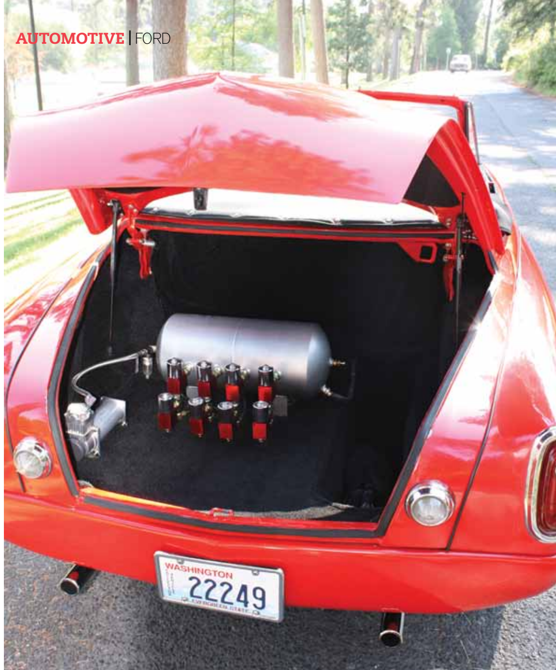
AUTOMOTIVE | FORD